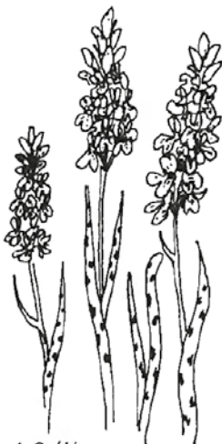
Early Purple Orchid

Please note due to the delicate balance of wildlife- NO DOGS (except Guide Dogs) ARE PERMITTED in the wood